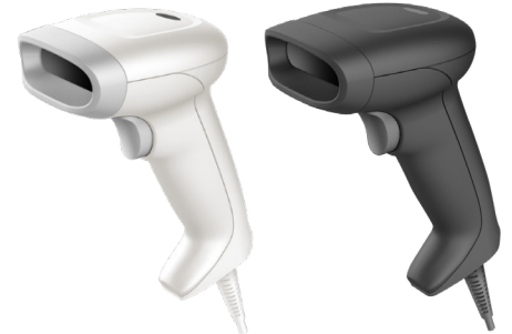
Voyager 1350g is an affordable 2D Area imager scanner

Voyager 1350g supports all popular 1D and 2D barcodes, as well as image capture capability. Incorporating latest technology from Honeywell, Voyager 1350G is easy to install and configure, the user being able to quickly select configurations and personalize the scanning experience. Voyager 1350G is compatible with Honeywell's advanced EZConfig and support all common POS drivers, being ready to adapt to different applications and requirements.